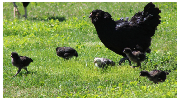
Momma and chicks adventuring in the yard.

They seem to be like dominoes here on our farm. I believe we have a few more hens that would hatch for us if we let eggs sit in nests longer than half a day. I have another that seems to be trying to convince me to let her keep eggs and I just may do so! Or maybe I'll let her hatch a few peafowl eggs.