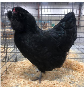
UFPA Spring Show Champion Large Fowl Black Ameraucana hen shown by Athena Balderas

We're hoping to have at least a couple birds ready when the show season starts up again. Our fertility has been fantastic and we've had great hatches but by bringing in new Ameraucanas over the past couple of years, as we've struggled with neighbors over their disdain for crowing, our egg color has suffered. There are very few we're as keeping as we try to get back to a nice shade of blue.